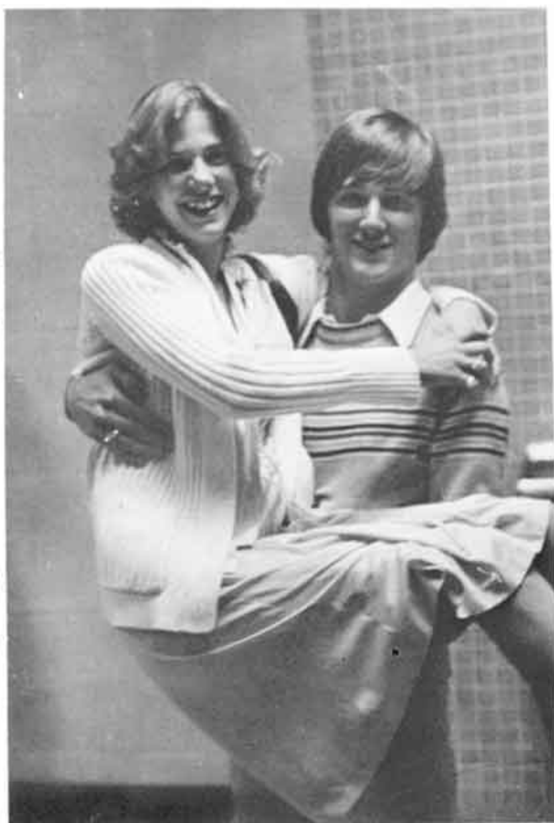
Jazz Band 2; Musical 2 3; Cross Country 1,2,3 4; All State 3,4; Basketball 1,2,3,4; Track 1,2,3,4; All League 2 3,4; CO-op 4